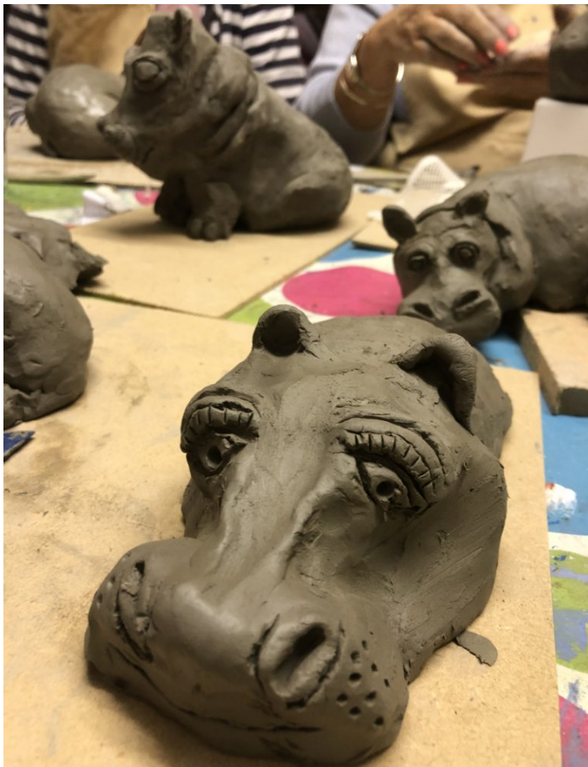
Clay hippo sculptures.