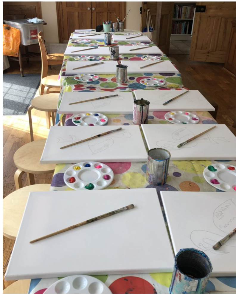
Art party set up for children.

And as if all of the above isn't enough, Geeta offers one-to-one tuition for children and adults and also runs art parties for children from age five to 12 years-old. You can also arrange bespoke classes for a group of friends or colleagues.