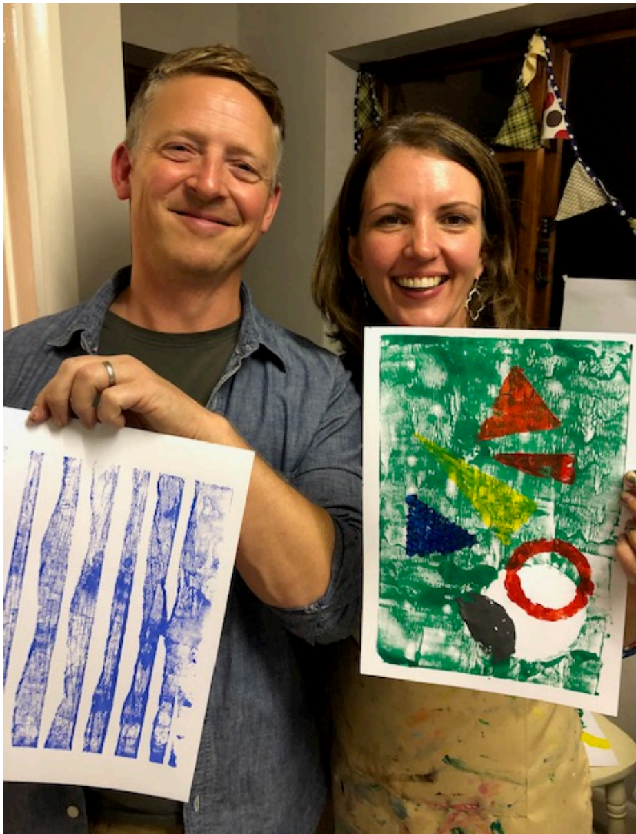
Date night at The Art House.