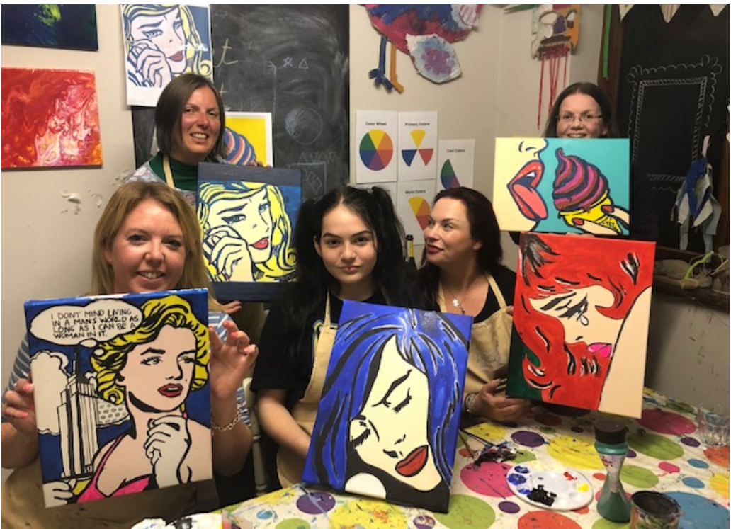
Pop Art painting class for adults.