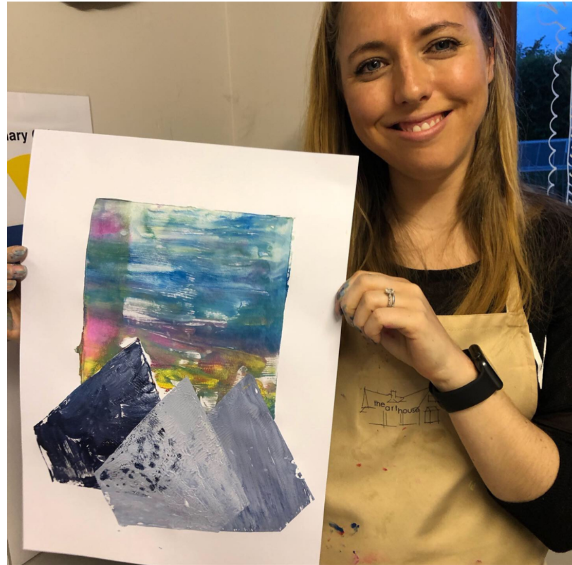
Monoprinting adult class.

two!) of Prosecco is included or you can enjoy a cup of tea while painting.