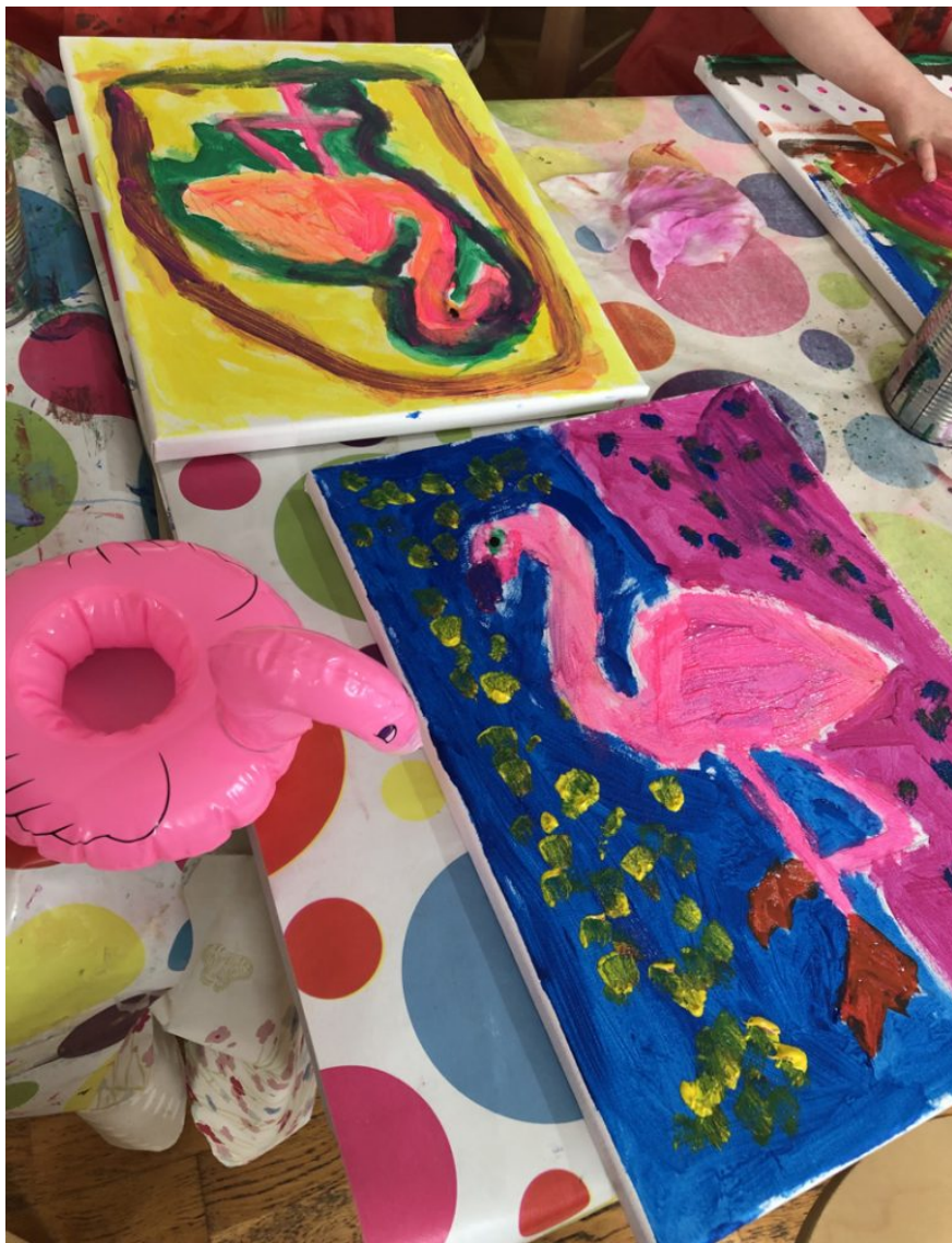
Flamingo themed Art party.